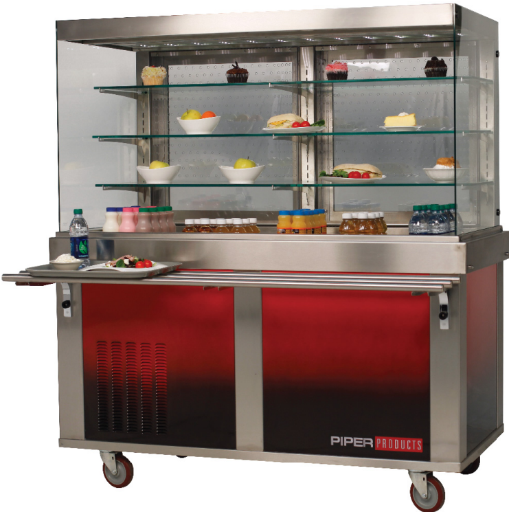
Custom Elite 4-OTR-3

Our OTR series cabinets come in a variety of styles and sizes to fit your needs. They are available in 3 different lengths and can be ordered as a drop-in, or as part of our Elite series to interlock directly into your cafeteria lineup. They are also available without the condensing unit for remote refrigeration applications. Their unique design allows 24 hour display capability, eliminating the daily labor of loading and unloading product. They incorporate tempered glass and stainless steel in a modern and attractive design that is lit with LED lights, putting the focus on the food in typical Piper fashion. Storage capacity is highlighted by 14" deep adjustable shelves, and bottom wells that can accommodate drinks, salad bowls, or 4" deep steam pan containers. For added security, roll-down night curtains are available.